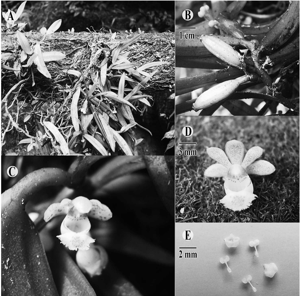
Figure 2. Gastrochilus brevifimbriatus S. R. Yi. —A. Habit. —B. Infructescence. —C. Inflorescence. —D. Flower. —E. Operculum and pollinia.

Phenology. Gastrochilus brevifimbriatus was observed in flower from August to September, while fruits were seen from October to November of the next year.