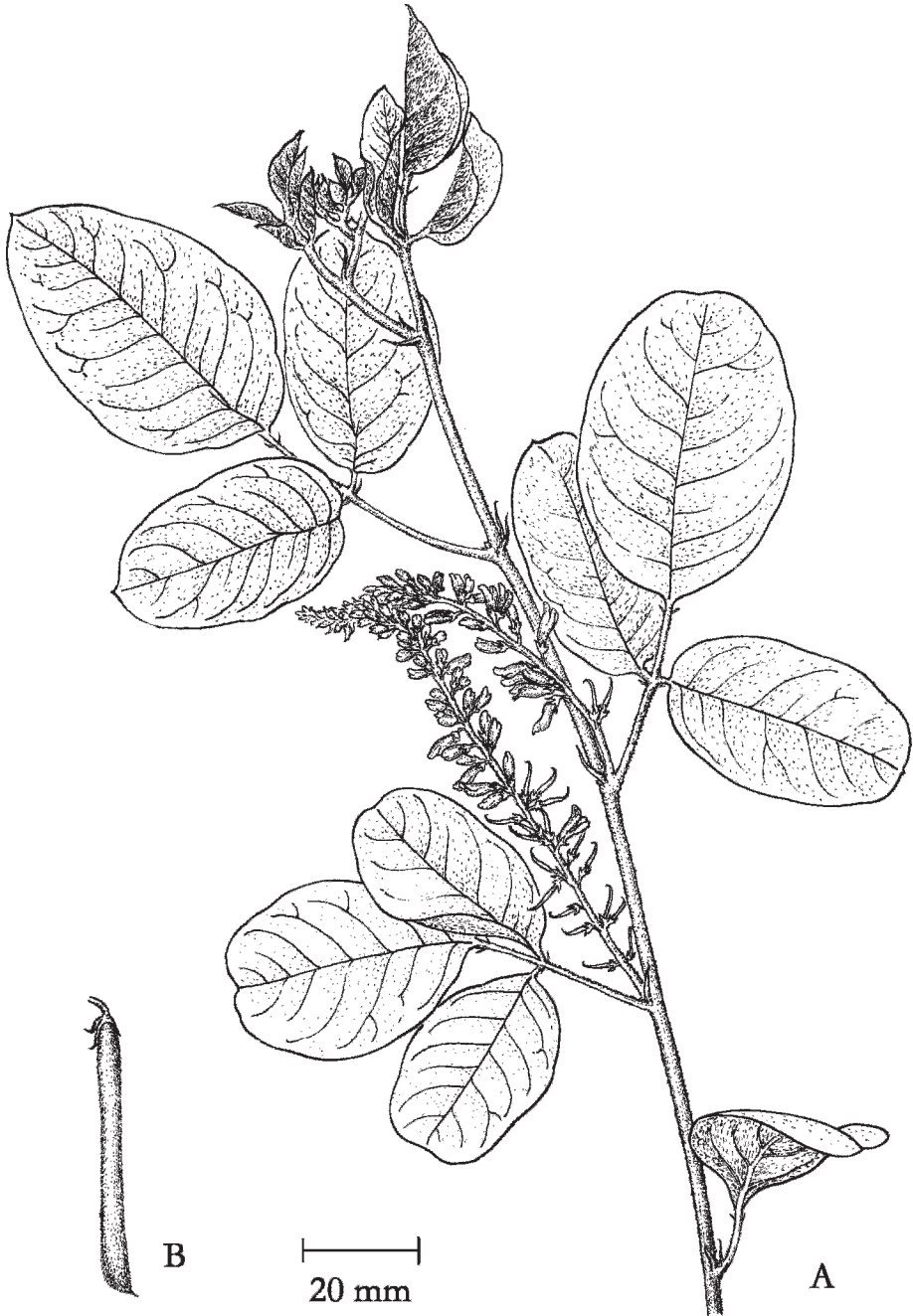
Figure 2. Indigofera megaphylla X. F. Gao. —A. Flowering branch. —B. Fruit. Drawn by Jian Gu from the holotype Gao & Xu 10057 (CDBI) for A and G. D. Tao 38875 (HITBC) for B.

dense spreading brown hairs; bracts ovate, ca. 2.5 \times 1.2 mm, with adpressed hairs; pedicels 0.5–1 mm. Calyx 2.5–3 mm, the lobes narrowly triangular, ca. twice the length of the tube, densely spreading hairy; corolla purple, 7–8 mm, standard ovate-oblong, 4–4.5 mm wide, dorsal surface with densely spreading