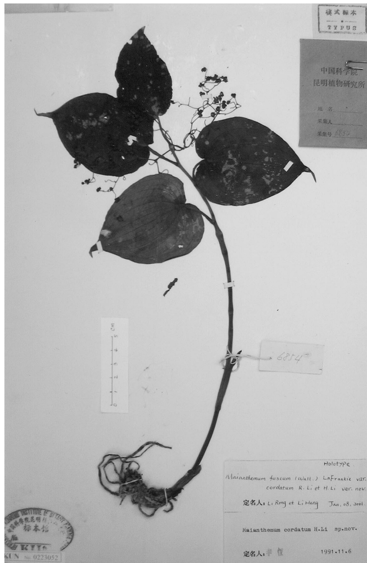
Figure 2. Maianthemum fuscum var. cordatum (Dulong Jiang Expedition 6854, holotype, KUN).

Maianthemum fuscum (Wallich) LaFrankie var. cordatum R. Li & H. Li, var. nov. TYPE: China. Yunnan: Gongshan Xian, Dulong Jiang Valley, W side of Gaoligong Mountains, under forest, 2200 m, 16 May 1991, Dulong Jiang Expedition 6854 (holotype, KUN; isotype, MO). Figures 1F, 2.