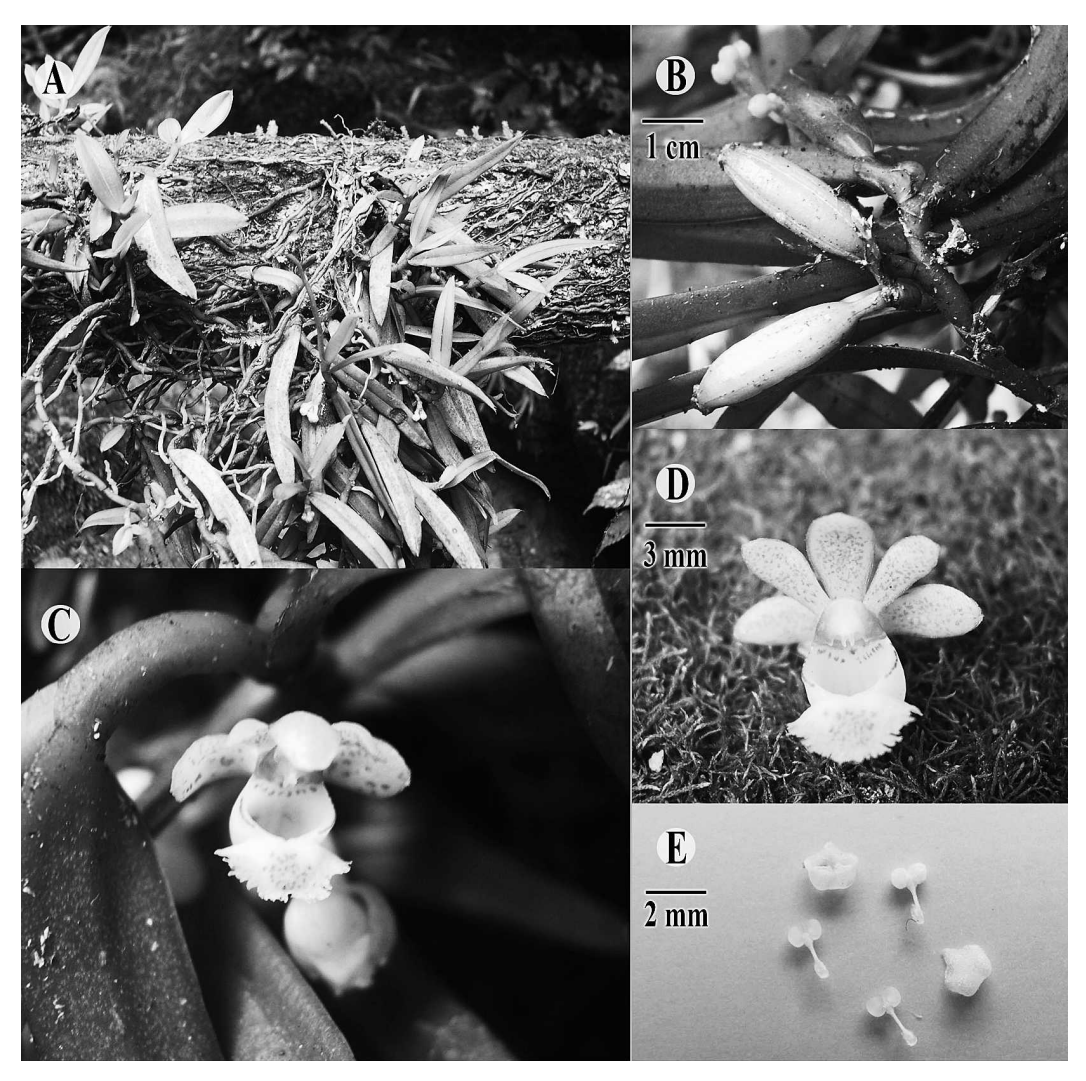
Figure 2. Gastrochilus brevifimbriatus S. R. Yi. —A. Habit. —B. Infrutescence. —C. Inflorescence. —D. Flower. —E. Operculum and pollinia.

Phenology. Gastrochilus brevifimbriatus was observed in flower from August to September, while fruits were seen from October to November of the next year.