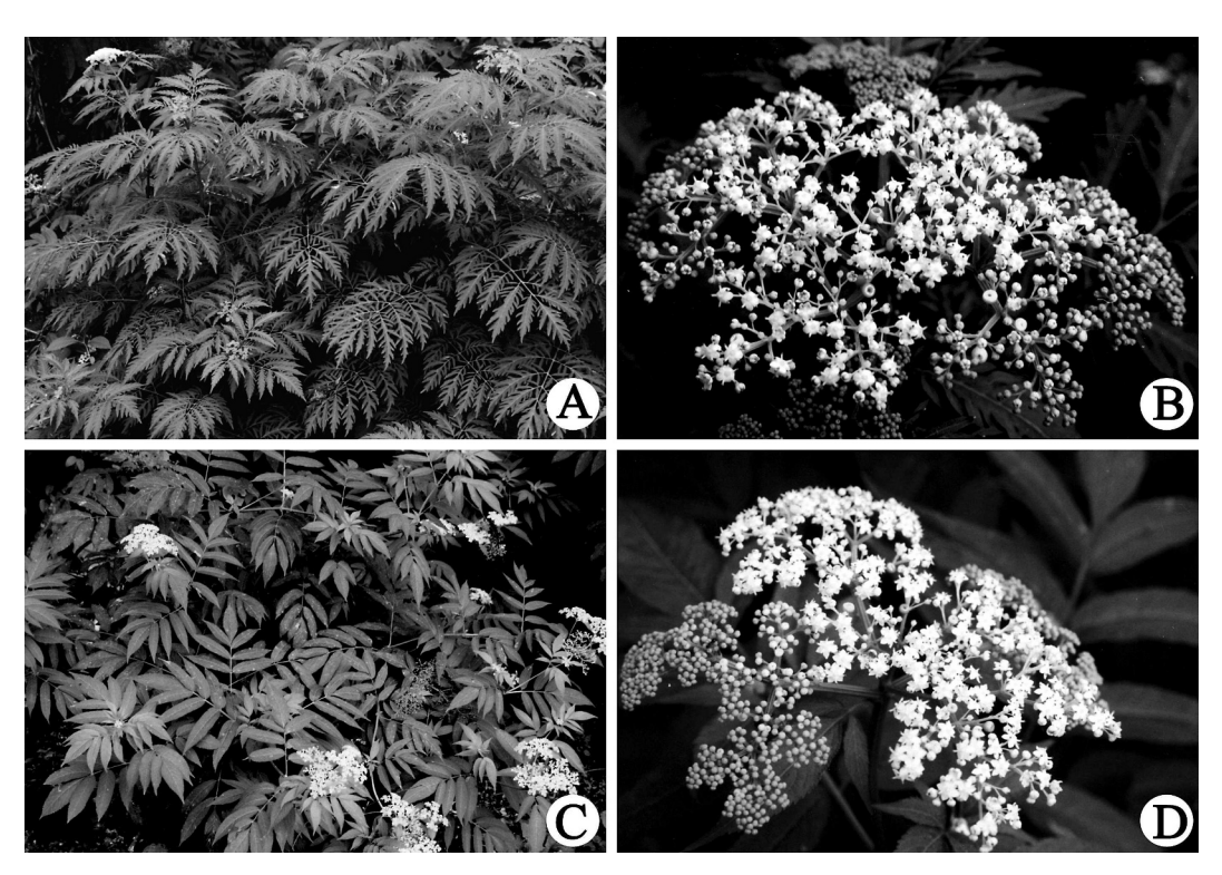
Figure 2. Habit and inflorescences for Sambucus chinensis. —A, B. S. chinensis var. pinnatilobatus. —C, D. S. chinensis var. chinensis.