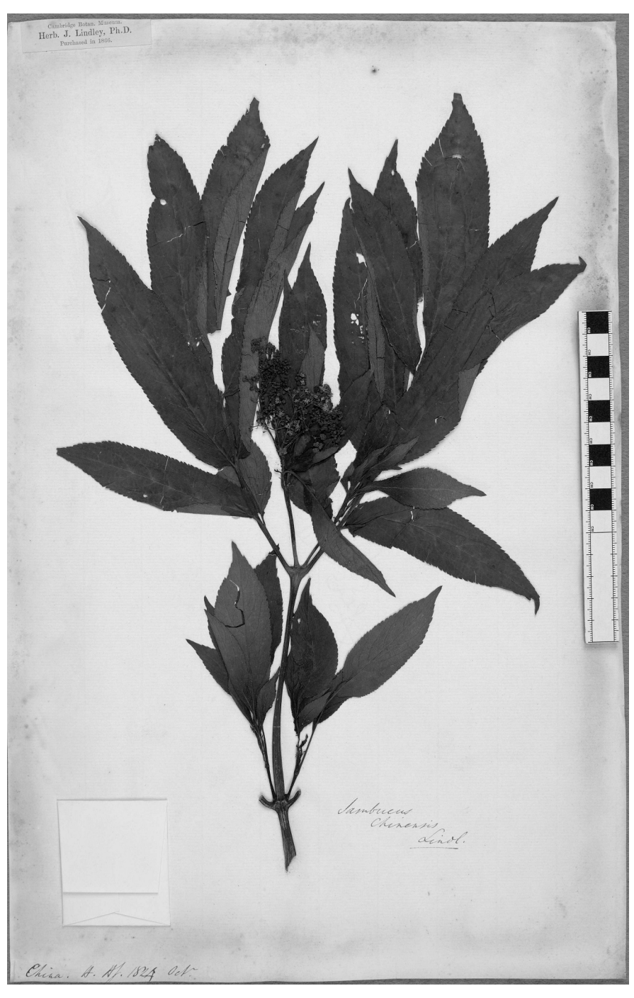
Figure 1. Lectotype of Sambucus chinensis Lindley.