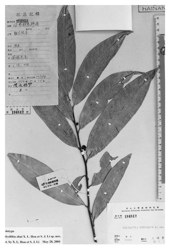
Figure 2. Holotype of Polyalthia zhui ( Hainan Western Expedition 264 , IBSC).

After having compared the specimens with the known species of Polyalthia recorded in various floras and systematic treatments (Blume, 1830; Hooker & Thomson, 1855, 1872; Merrill, 1912, 1923; Sinclair, 1955; Backer & Bakhuizen, 1963; Huber, 1985; Ban, 2000), we found a few species with petals less than 10 mm long. Among these,