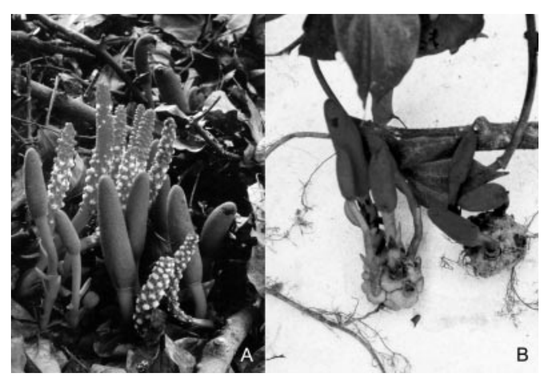
FIGURE 2. Colony of Balanophora hongkongensis K. M. Lau, N. H. Li & S. Y. Hu. A, staminate and carpellate plants in natural habitat; B, Two carpellate plants of Balanophora hongkongensis parasitic on roots of Bauhinia championii .