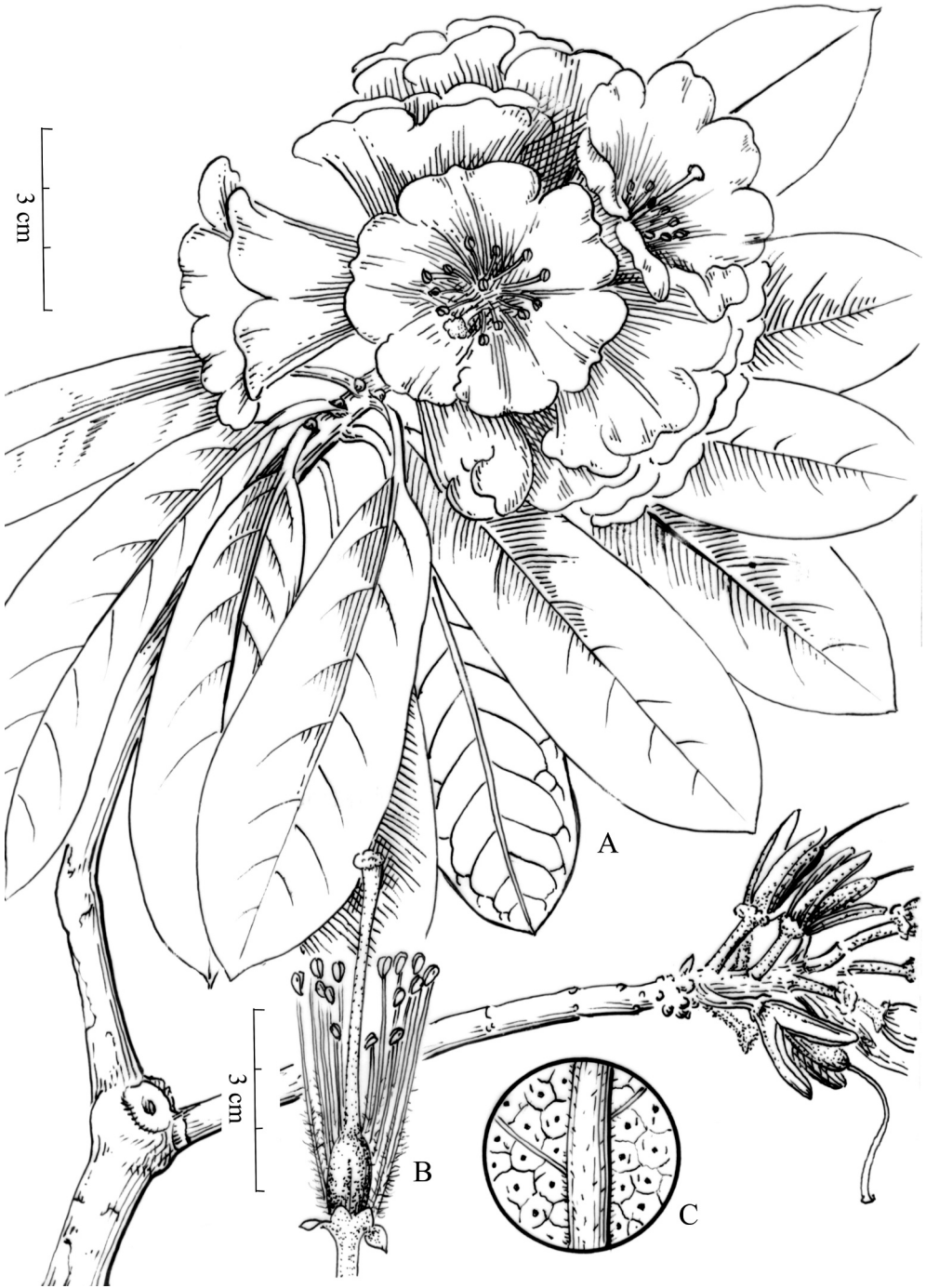
Figure 1. Rhododendron huangpingense Xiang Chen & Jia Y. Huang. —A. Flowering branch. —B. Androecium and gynoecium, with the corolla removed. —C. Detail of the leaf blade abaxial surface. Drawn by H. Xie from the holotype Xiang Chen 08024 (HGAS).