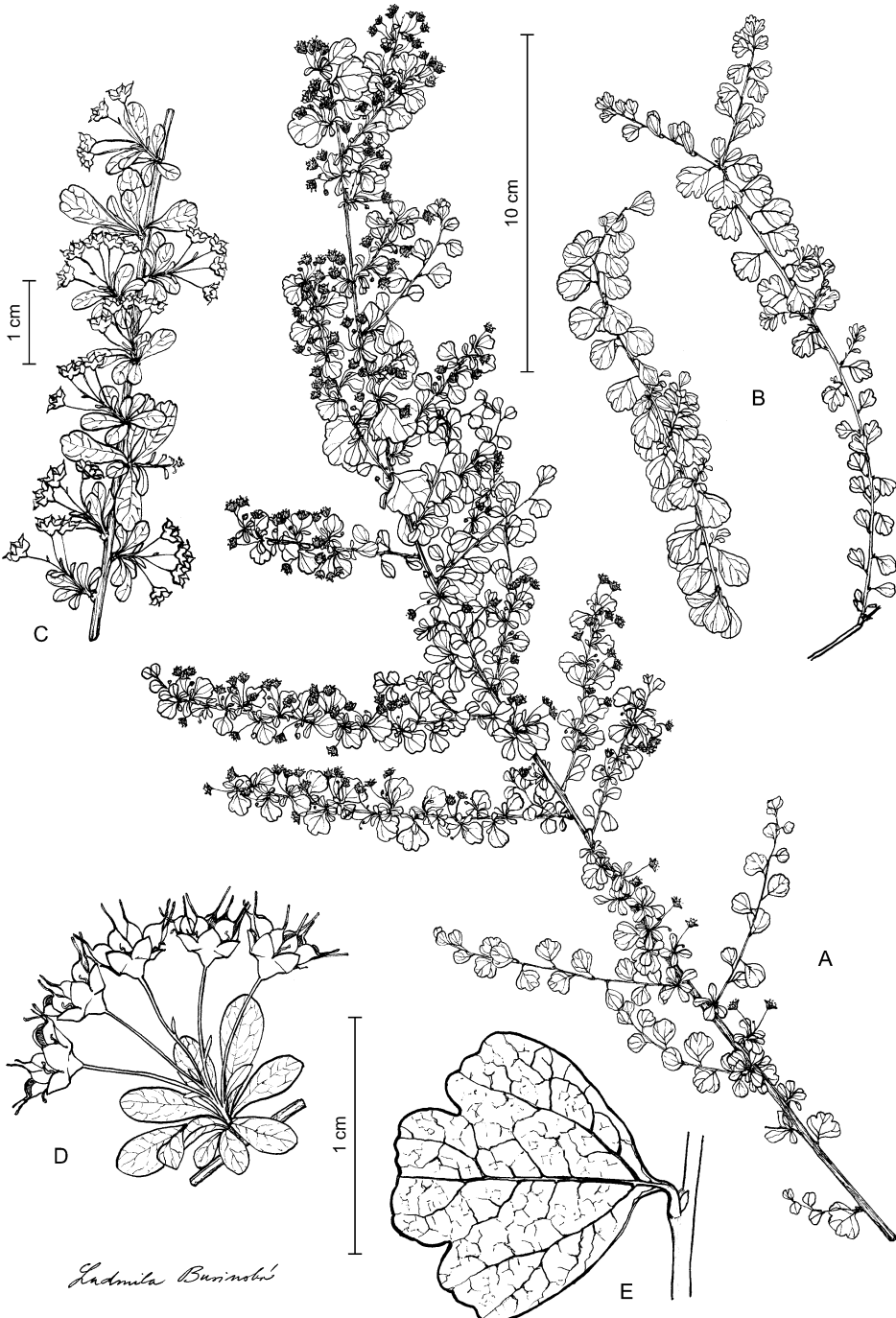
Figure 2. Spiraea adiantoides Businský. —A. Fertile branch in July of second year. —B. Two sterile long shoots with secondary lateral summer shoots. —C. Portion of fertile branch. —D. Inflorescence in fruit with basal leaf rosette. —E. Fully developed leaf of sterile long shoot, abaxial view. Drawn by Ludmila Businská, parts A and E from the holotype, R. Businský 30403 (G), B–D from isotypes.