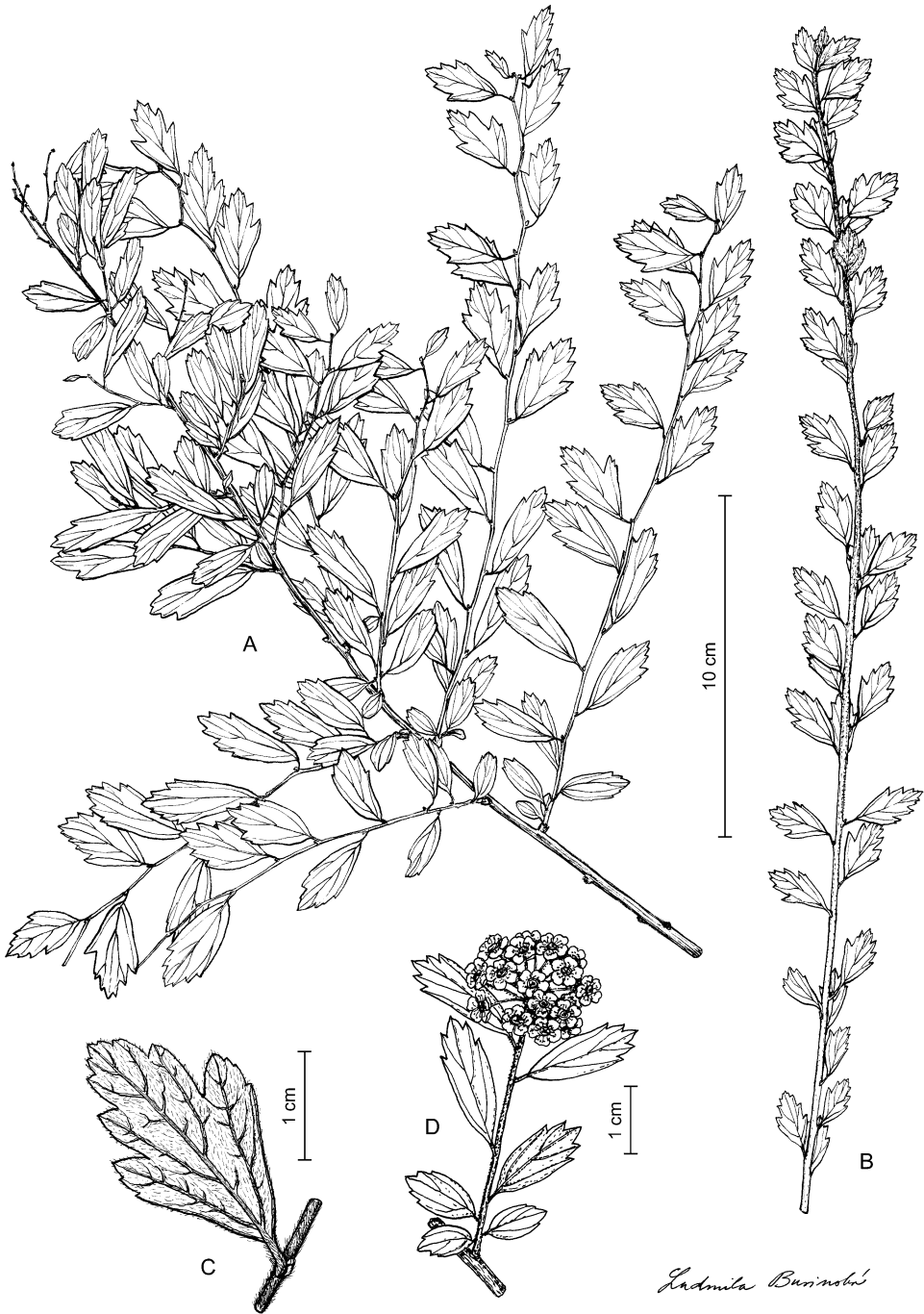
Figure 3. Spiraea tatakaensis I. S. Chen. —A. Branch in autumn of second year with fertile short branchlets in the terminal part after pedicels fell off. —B. Sterile long shoot. —C. Fully developed leaf of sterile long shoot, abaxial view. —D. Short branchlet with inflorescence. Drawn by Ludmila Businská, parts A–C from November collection, R. Businský 66401 (G), D from Sheng-You Lu 14766 (TAIF), both from the type locality.