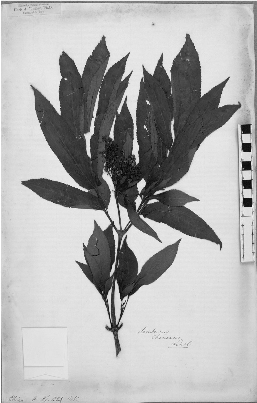
Figure 1. Lectotype of Sambucus chinensis Lindley.