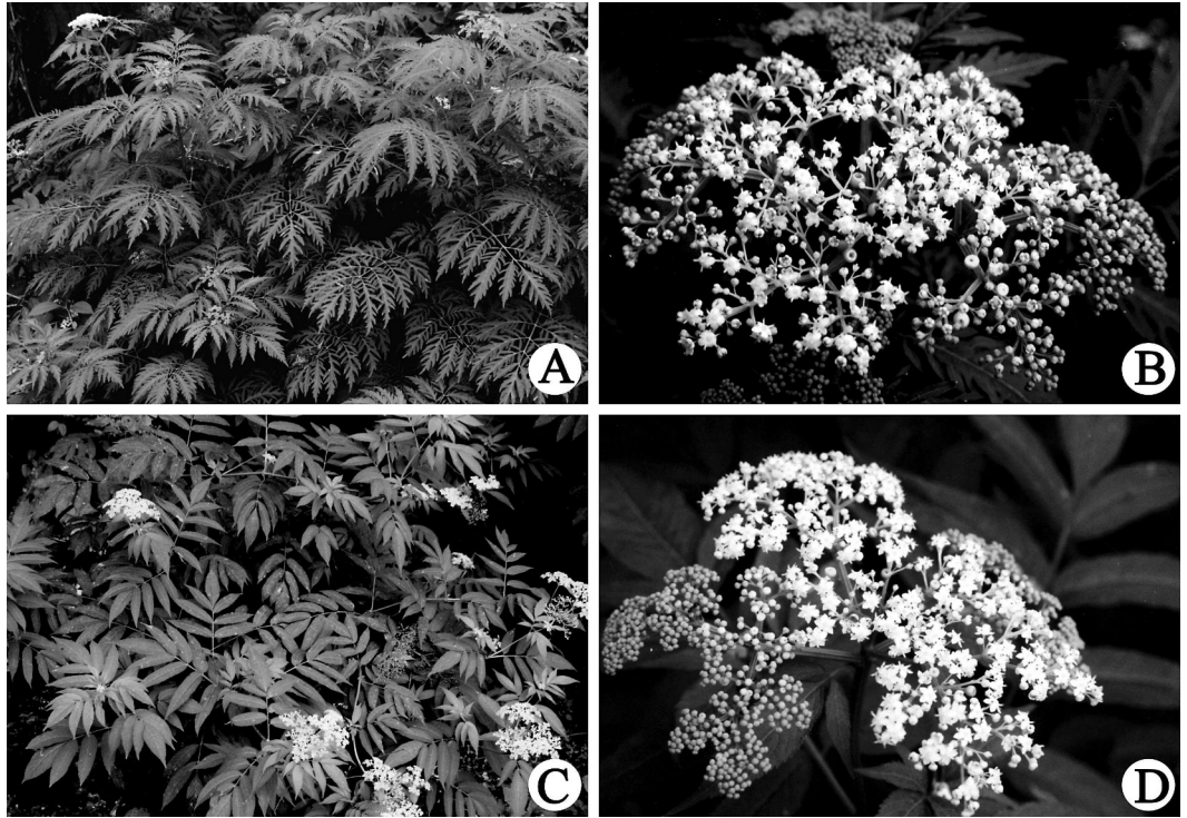
Figure 2. Habit and inflorescences for Sambucus chinensis . —A, B. S. chinensis var. pinnatilobatus . —C, D. S. chinensis var. chinensis .