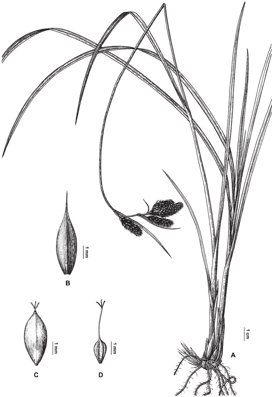
Figure 1. Carex bijiangensis S. Y. Liang & S. R. Zhang. —A. Plant. —B. Female glume. —C. Utricle. —D. Nutlet. Drawn from the holotype, Tsai 58022 (PE).

Rhizome short; culms tufted, 25–50 cm high, 1–2.5 mm wide, triquetrous, upper part scabrid, with purple or dark brown, leafless and fibrillose sheaths at base. Leaves shorter than culms, 2–3.5 mm wide, flat, acuminate. Inflorescence racemose; lowest bract leaf-